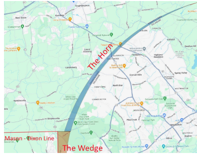
The Horn and the northern part of the 1850 Wedge; detail, slightly modified, from a Chester County Archives and Records Services Facebook post, July 11, 2024

The new survey also established the 4,169-foot-long Top of the Wedge Line as the extreme western border of Pennsylvania and Delaware; Hodgkins found that its length was greater than Graham had calculated. The Wedge, which was south of this line, was given to Delaware. The Horn, a curved tapering parcel of land north of the line that lay between Hodgkins' new western section of the Arc Boundary and the 1701 Arc Boundary, was given to Pennsylvania.